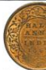
The legend within a wreath surrounded by a wreath. All surrounded by a raised, toothed rim.