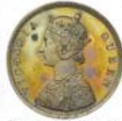
Crowned and robed bust of the Queen facing left. Divided legend: VICTORIA QUEEN All within a raised, toothed rim

Struck from dies prepared for the complete set of patterns produced