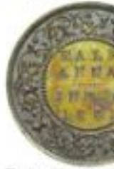
The legend within a wreath surrounded by a wreath. All surrounded by a raised, toothed rim