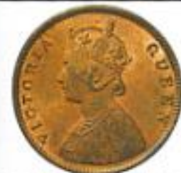
Crowned and robed bust of the Queen facing left. Divided legend: VICTORIA QUEEN All within a raised, toothed rim.